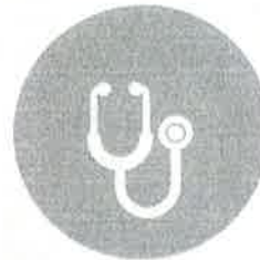
HEALTH ASSESSMENT AND PLANNING