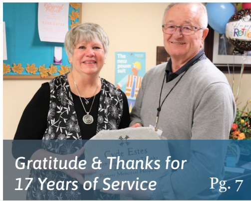
Gratitude & Thanks for 17 Years of Service