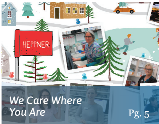
We Care Where You Are