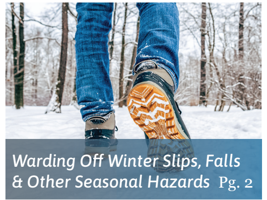
Warding Off Winter Slips, Falls & Other Seasonal Hazards Pg. 2